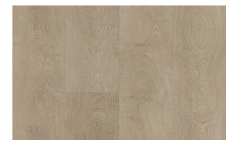
Siberia Color - Code : 7212