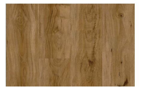
Blackbutt Color - Code : 7211