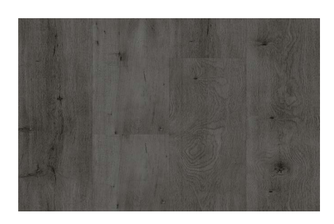
Cambridge Color - Code : 7217