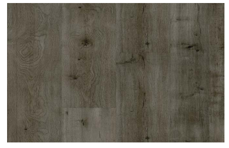
Oxford Color - Code : 7214