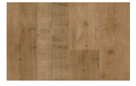
Chester Color - Code : 7210