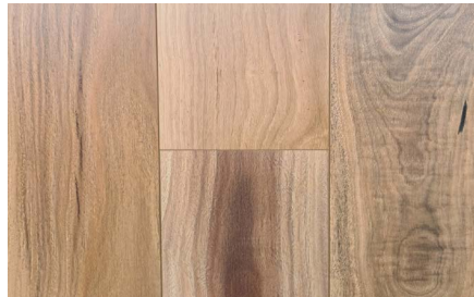
NSW Spotted Gum Color - Code : 8311