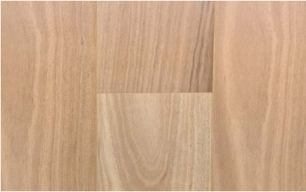
Blackbutt Color - Code : 8310