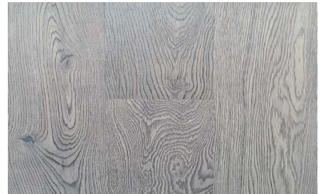
Smokey Grey Color - Code : 8315