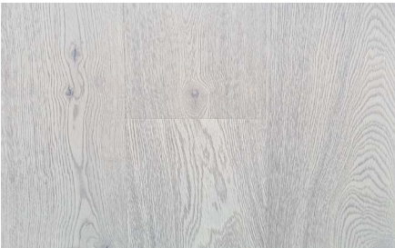
Moon Linght Color - Code : 8313