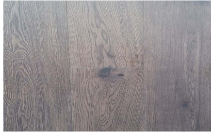
Chestnut Brown Color - Code : 8314