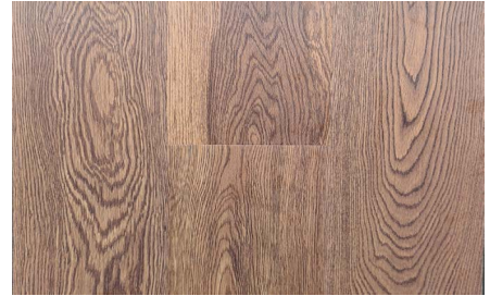
Le Chateau Color - Code : 8312